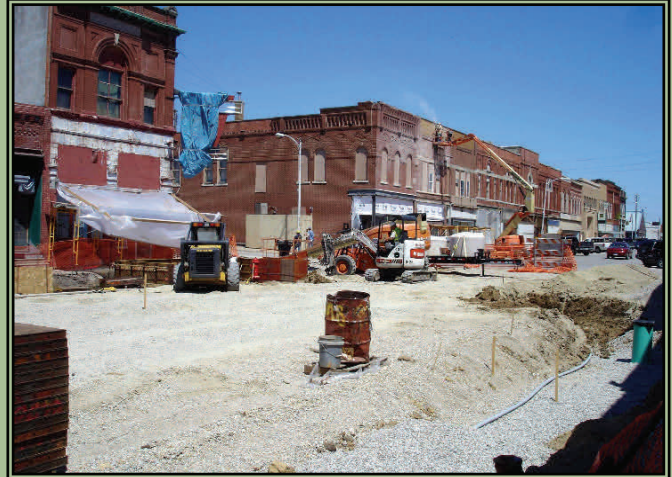
12 th Street Toward 7 th Avenue - May 17, 2011

Local funding is provided from a combination of cash reserves and essential purpose general obligation bonds. Total project cost is expected to be approximately $4.2 million.