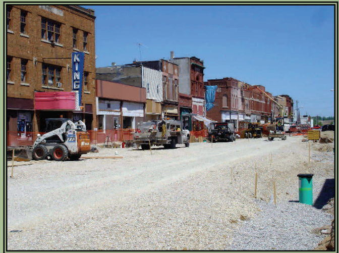
12 th Street Toward 8 th Avenue - May 17, 2011